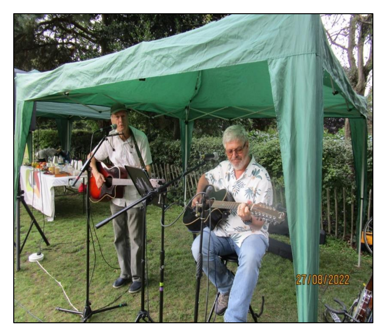
A Teddy Bears' Picnic in the ornamental garden. This was for the little ones and their families and everyone's teddies.