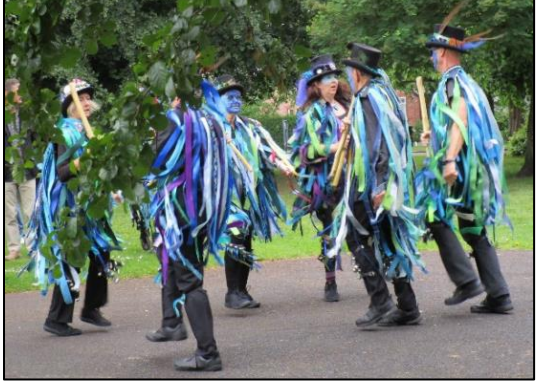
'Bollin Morris' entertained us with their colourful costumes, face paint and vigorous dancing. The juniors, called Morris Minors, danced too. Brilliant!