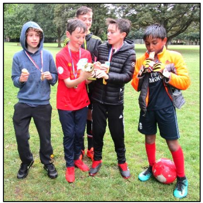
5-a-side Football Champions with their winners' cup and free ice creams