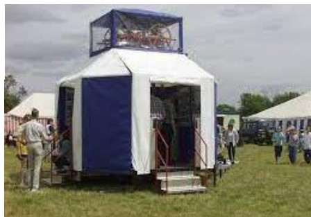
St Margaret's Church Mobile Belfry

June has brought us a very busy first week – with The Big Jubilee Lunch on Sunday 5 th and the Green Flag assessment the following Thursday - not an 'event' but very much a red-letter day in our calendar. Our Green Flag judge was particularly taken with the weeping beech and all aspects of the Ornamental Garden, the Acer bed, and Dawn's bank. Plans for a bigger, wilder wild-flower area within and below the Field of Hope promise more for the future.